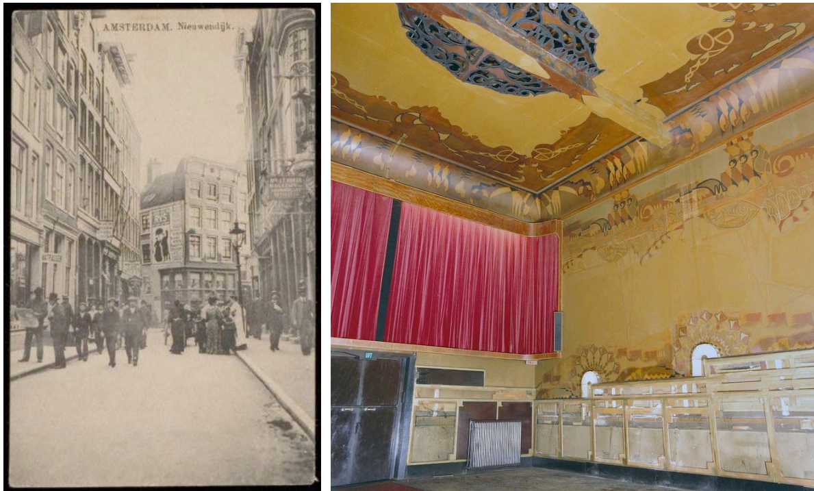
Figure 4 (left): Nieuwendijk 65–75, Amsterdam around 1910. Postcard from the Amsterdam City Archives photo collection. Figure 5 (right): Cinema Parisien’s 1924 art deco interior, before the move to the Filmmuseum at Vondelpark in 1987. Photo: Paul van Galen. Source: Cultural Heritage Agency of the Netherlands photo collection. Licence CC.BY-SA 4.0.

where it can presently be viewed. In these different forms, then, Cinema Parisien has been a part of Amsterdam cinema culture for the past one hundred and five years.