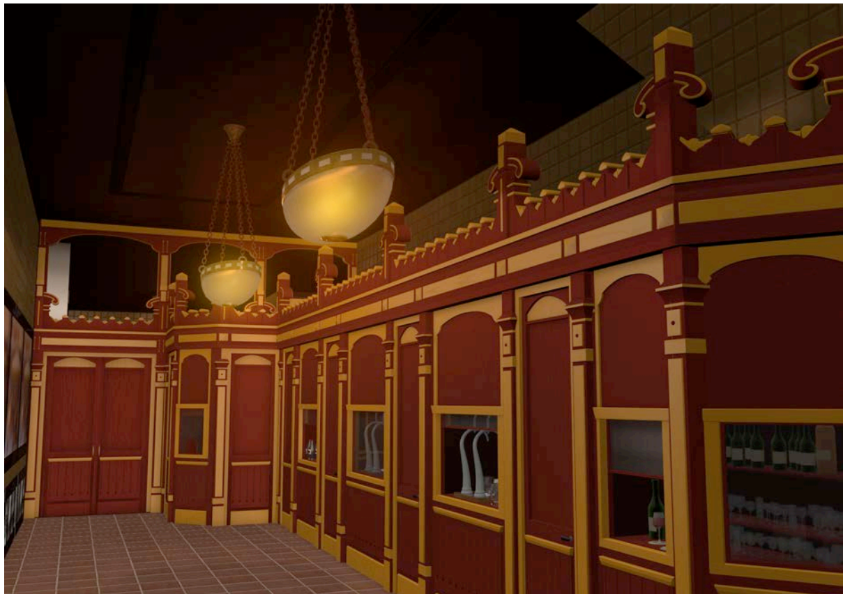
Figure 6: 3D model of the entry hall in the 1910 Cinema Parisien. Design: Loes Ogenhaffen.

The documentation of buildings that no longer exist usually does not cover all details of a building and its interior. Moreover, building a 3D visualisation provides new perspectives on existing knowledge, as in the case of the description of Cinema Parisien in