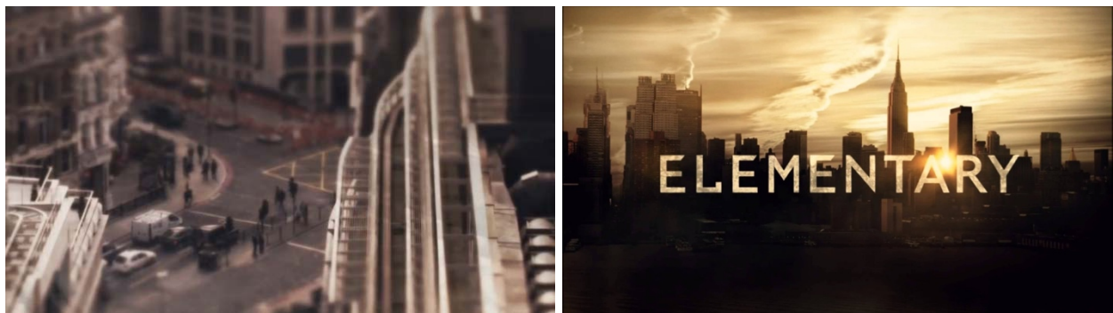
Figure 1 (left): Opening sequence: London from above. Elementary . CBS Studios, 2012–.

The figure of the detective becomes an ideal embodiment of these contrasting conceptualisations of the imperial and critical cosmopolitan city because, as Richard Lehan writes, “[d]etectives bring the city back to human scale” (84). In discussing Walter Benjamin's association between the flâneur and the detective, Dana Brand notes that each personage is constantly engaged in traversing and explaining the city. As virtuoso interpreters and readers of the city's sites, events, and people, many detectives, including Holmes, unify and reveal the potential chaos of the city through the exercise of human intellect by proposing a rubric of the principles that underlie and govern urban life. They thereby create a privileged site where competing ideologies of the city become visible, and where readers can glimpse the consequences of contact between the city's diverse districts and people. Modern Holmes adaptations Sherlock and Elementary thus construct a social ethic of contemporary urban life. Their differing approaches become apparent first through their opening credit sequences, contrasting a computational surveillance aesthetic or a ground-up view, secondly in the way each series positions Holmes vis-à-vis the diverse inhabitants of the city, and finally in the casting of Watson and the representation of women.