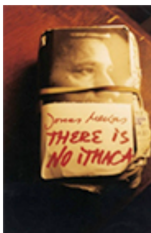
Figure 2: Jonas Mekas, There Is No Ithaca (Black Thistle Press, 1996)