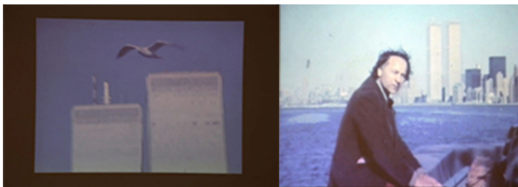
Figures 5 and 6: WTC Haikus (2010)

16mm film transferred to video, 14min 4sec