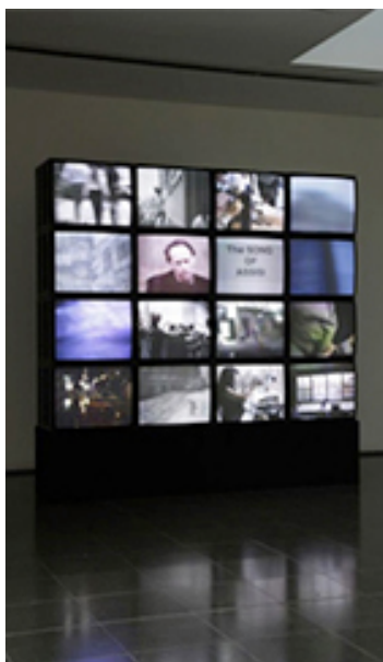
Figure 4: Lavender Piece (2012) 16mm film transferred to video, various dates, each film 5–15min Installation view, Jonas Mekas, Serpentine Gallery, London

All the objects displayed—such as the filmmaker's technical equipment, notes, poems, sheets and the Anthology Film Archive banner designed in 1970 for the Archive's opening that resembles the flag of a new country—and all the heterogeneous materials shown are evidence of a particular memory: traces of a life. An installation of a set of sixteen monitors titled Lavender Piece (2012) simultaneously displays all Mekas's different 16mm films. Views of streets, snow, people, portraits of the filmmaker are mixed without a narrative theme or a chronological order, evoking an instantaneous self-portrait of the artist, composed of glimpses selected by his gaze, rather than images of his body. The flow of images and sounds comprise the exhibition and somehow become indistinguishable, forming fragments of an entire, unique project.