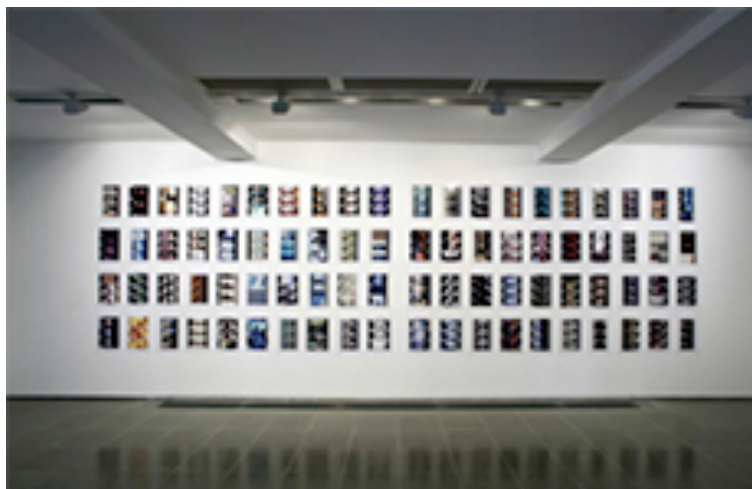
Figure 1: My Two Families (2012) Photographic prints of 16mm film frames 43.2 x 27.9 cm Installation view, Jonas Mekas, Serpentine Gallery, London