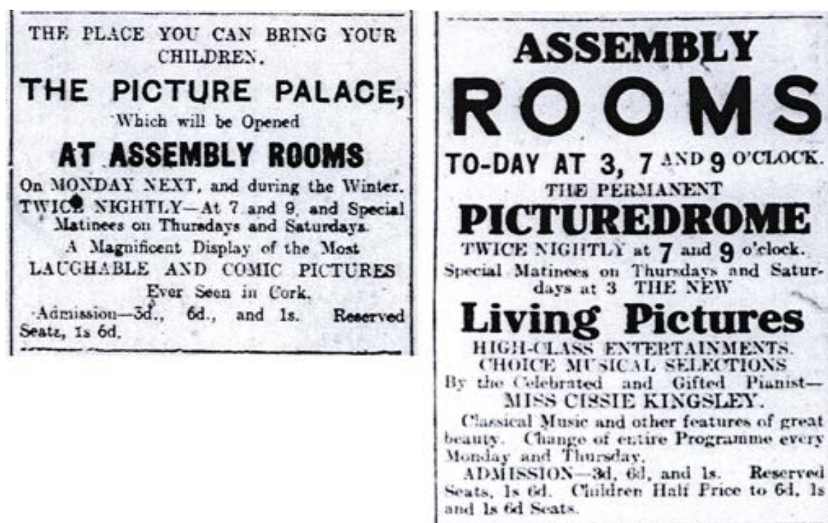
Figure 4: On the left, the Picture Palace at the Assembly Room ( Cork Examiner 29 Oct. 1910: 6); On the right, the Assembly Rooms Permanent Picturedrome ( Cork Constitution 21 Jan. 1911: 4).