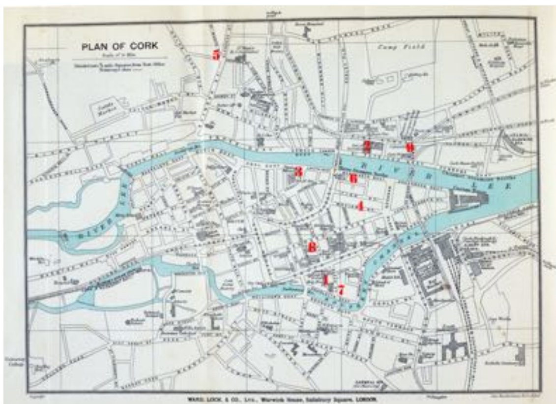
Figure 3: Map of Cork in 1915 showing the locations of the theatres and picture houses between 1910 and 1913. (1) Assembly Rooms, South Mall. (2) Palace Theatre of Varieties, King Street. (3) Opera House, Lavitt's Quay. (4) Electric Theatre, Maylor Street. (5) St. Mary's Hall, St. Mary's Road. (6) Tivoli Picture Theatre, Merchant's Quay. (7) Fr. Mathew Hall, Queen Street. (8) Imperial Cinema, George's Street. (9) Coliseum, King Street.