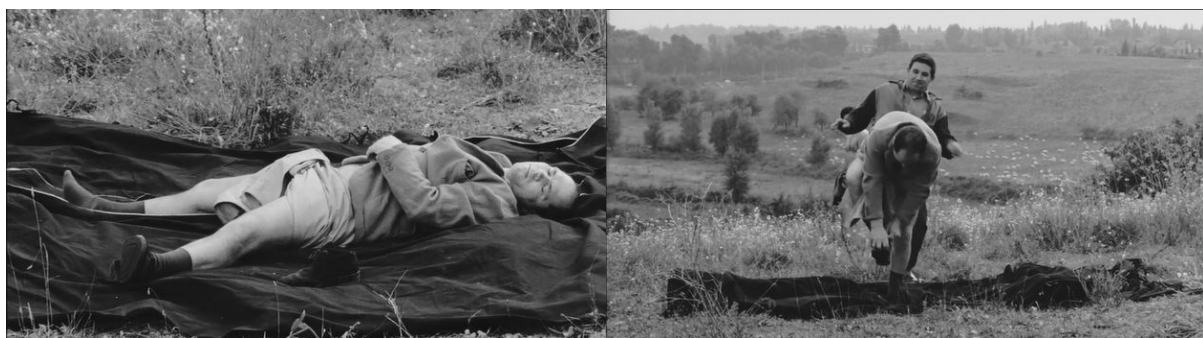
Figures 8 and 9: Stracci in Chaplinesque mode. La ricotta . Eureka Entertainment, 2012. Screenshots.

By purposely representing him in Chaplinesque style, Pasolini seeks to isolate Stracci from the art-historical excesses he hopes to exorcise in the making of La ricotta . However, while Stracci's alignment to the cinematic may be considered to remove him from the art-historical citation in the film, the stylistic parallels between Mannerism and early cinema via Chaplin should also be remarked. Just as Mannerism highlights the corporeal through its