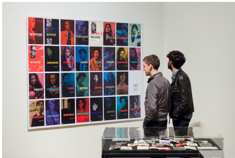
Figure 4: Installation view at the Whitechapel Gallery. Chris Marker: A Grin Without a Cat (16 April – 22 June 2014).

The memory of the traveller comprises all the fragments taken from a collective memory. Marker’s conception of travel as historical memory is very visible in his films, as is his fascination with different cultures. On the second floor of the gallery travel was connected with war and revolution, displaying black and white photographs by the director, and film extracts in a section titled “When the Century Took Shape: War and Revolution”. The rare display of the entire collection of Petite Planète (1954–1958), a series of 31 travel books realised by Marker when he was working as an editor for the Éditions de Seuil, was remarkable. The posters of the covers, each dedicated to the image of a woman, were displayed on a wall, recomposing a mosaic of faces from Iran, Japan, Yugoslavia, China and many other countries. Every volume in fact begins with the photograph of a woman, and contains images from Marker’s and his friends and colleagues’ travels and personal archives.