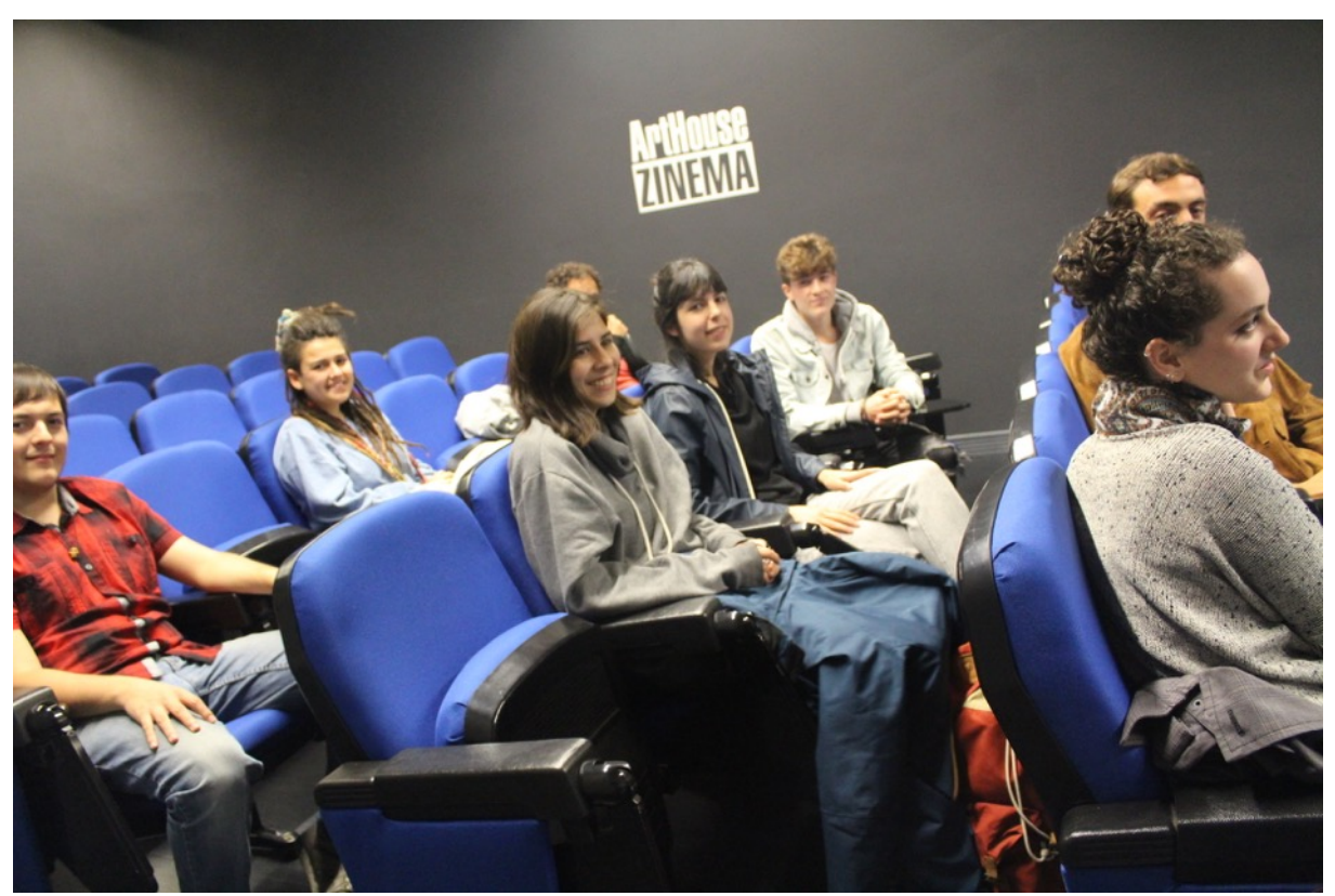
Figure 12: EUFA students of the University of the Basque Country (UPV/EHU).

by film critics or film industry professionals to facilitate students' performance and bolster confronting situations.