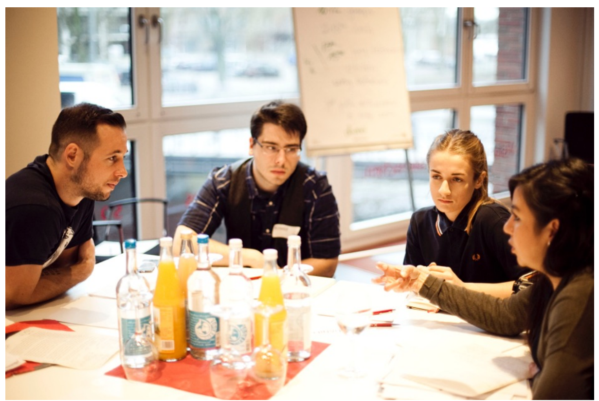
Figure 14: First round of the deliberations in Hamburg at Körber Stiftung (EUFA 2016 edition).

The aim of the afternoon session (in 2016), or the second day (in 2017) was to outline criteria for the winning film as well as to debate the purpose and possibilities of the award as such. First, to foster direct exchange, the students would discuss the criteria for the award in small groups of four. In 2016 the students gathered arguments for each of the remaining films during a roundtable debate, moderated by me. Instead of presenting their favourite film and justifying their decision, though, the students were asked to explain which of the other films would be the prime competitor to their favourite—and why. This round offered another opportunity not to simply dismiss the other films, but to highlight their strengths and qualities. The students were able to practice their rhetorical skills by speaking in favour of one's selected film(s) and by trying to convince their fellow jury members. In 2017 this process was replaced by a more thorough discussion of the award criteria.