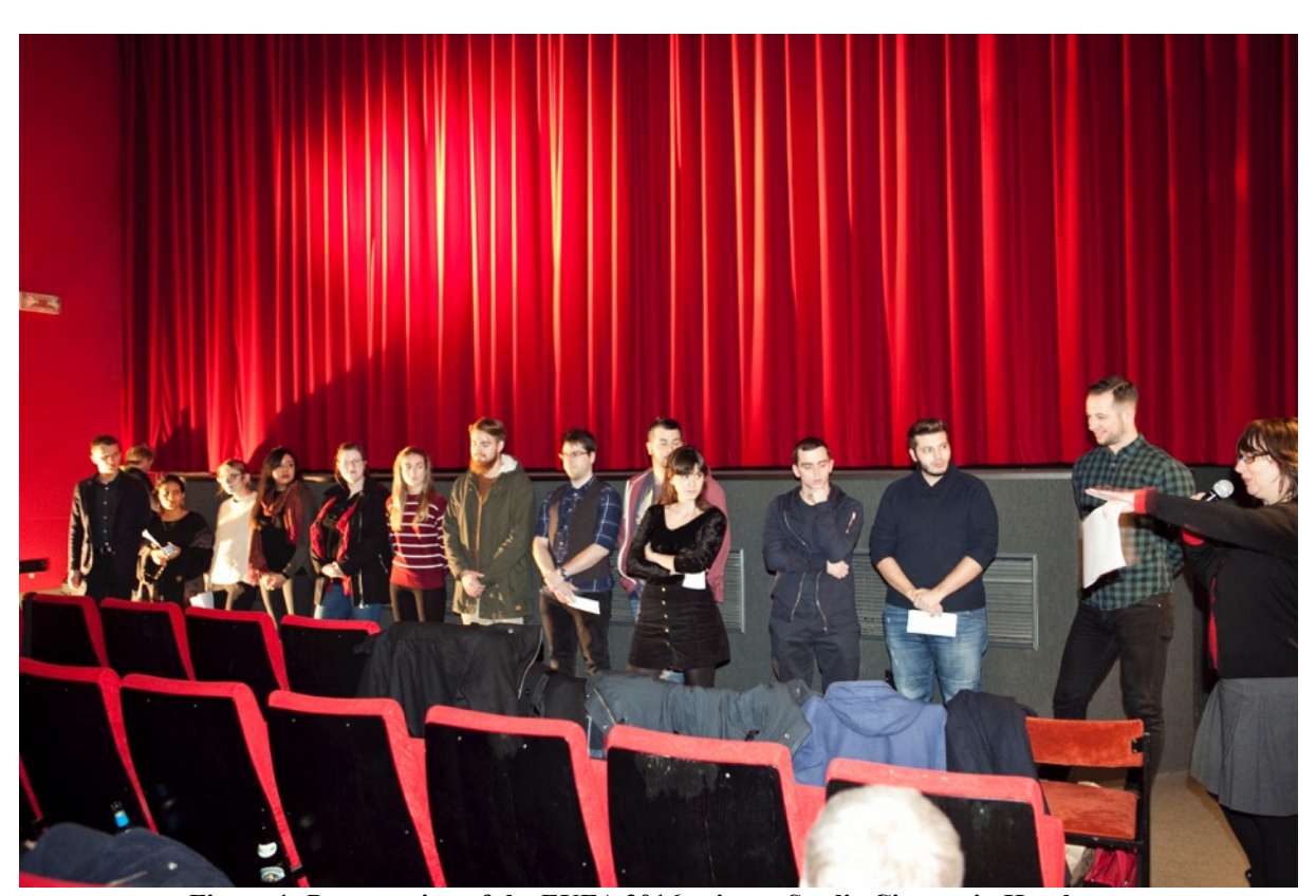
Figure 1: Presentation of the EUFA 2016 prize at Studio Cinema in Hamburg.

Abstract: The "Teaching European Cinema" dossier has grown out of the European University Film Award (EUFA) project that was initiated in 2016 by Filmfest Hamburg in collaboration with the European Film Academy (EFA) and the European Network for Cinema and Media Studies (NECS). In its second edition in 2017, the EUFA connected twenty European universities in a common teaching project in which five nominated films were analysed and discussed in courses of the respective universities. Subsequently, one student representative per country joined the three-day student jury deliberation in Hamburg and voted for the final EUFA winner. In 2016, Ken Loach's I, Daniel Blake (2016) won the inaugural EUFA; in 2017, Guðmundur Arnar Guðmundsson's Heartstone (Hjartasteinn, 2016) was awarded the prize. The dossier works on different levels: first, it aims to present the EUFA project to a wider public; second, it promotes an exchange among the participating colleagues; and third, it operates as a teaching dossier for scholars within the wider field of European film and media studies to discuss questions of how best to teach contemporary European cinema.