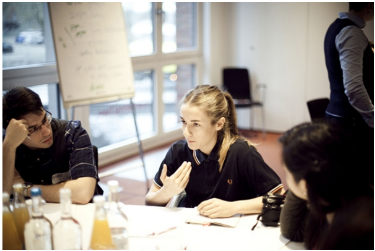
Figure 10: Student deliberations at Körber Stiftung, Hamburg, 2016 EUFA edition.

representation of Europe and Europeans and the extent to which the five films were somehow representative of the many troubling, challenging and exciting aspects of the notion of Europe, living in Europe or feeling a sense of belonging in Europe. I think this was one of the most striking topics of discussion instigated by the EUFA film selection. My students—as far as I was concerned, or as far as I had experienced until then—do not seem to be particularly interested or engaged in the idea of a (some sort of) European identity. Contrary to my own experience when I was a student twenty years ago, "Europe" as a larger cultural construct or category of belonging does not seem to hold my students' interest or imagination. Rarely do we address issues from a distinct European perspective; it seems to be an element of our identity that goes without saying. Watching and extensively discussing five films that were somehow chosen on the basis of their "Europeanness" forced my students to come to terms with and think through their notions of what it means to be European, to identify as such or, in some cases, not to identify as such.