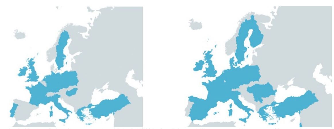
Figure 2 (left): Participating countries, EUFA 2016: Czech Republic, France, Germany, Greece, Hungary, Ireland, Italy, Netherlands, Poland, Portugal, Sweden, Turkey and United Kingdom. Figure 3 (right): Participating countries, EUFA 2017: Belgium, Czech Republic, Denmark, Finland, France, Germany, Greece, Hungary, Ireland, Israel, Italy, Netherlands, Poland, Romania, Serbia, Spain, Sweden, Switzerland, Turkey and United Kingdom.

Despite these setbacks, we succeeded in starting the initiative in 2016 with the impressive number of thirteen participating universities in thirteen different countries. In the second edition in 2017 the EUFA project already grew to twenty universities in twenty different countries.<sup>2</sup> After this successful start the aim is to further expand the project to eventually include universities from all of the forty-something countries represented in the European Film Academy.<sup>3</sup>