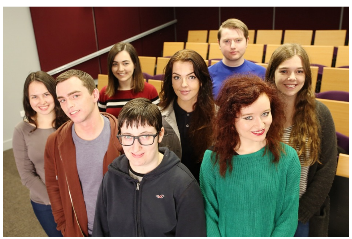
Figure 9: Students from the University College Cork 2016 EUFA class.

At University College Cork, Ireland, the European University Film Award (EUFA) initiative was incorporated in a core module of the MA in Film and Screen Media, devoted to the topic of Film and Screen Cultures and Industries. This flexible, team-taught module was an ideal pedagogic framework for the award and its activities. The MA combines theory and creative practice, and interfaces with the film and culture industries, with a particular emphasis on production, distribution, archives and film festivals. Hence, EUFA provided an extraordinarily rich opportunity to expand our MA students' understanding of film in the context of cultural institutions such as the European Film Academy, the European Film Awards and Filmfest Hamburg.