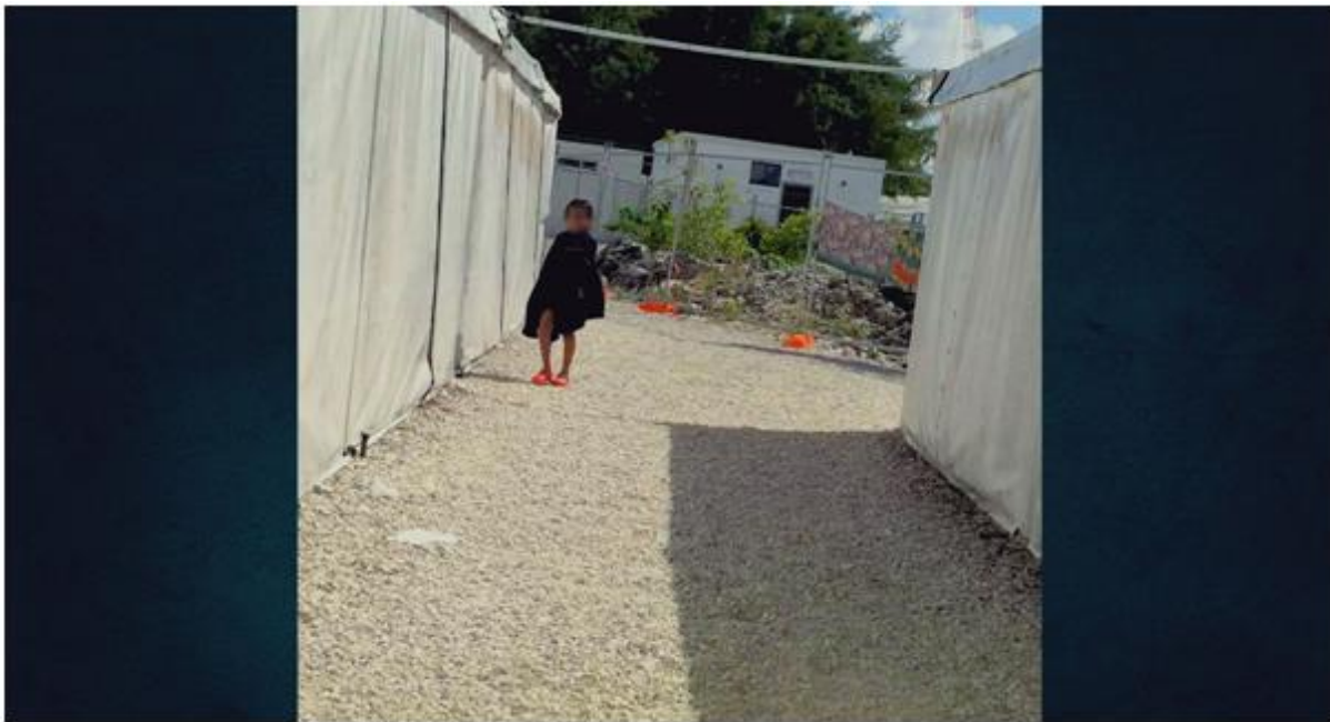
Figure 1: Blurred shot of a child in the camp. Chasing Asylum (Eva Orner, 2014). Nerdy Girl Films, 2014. Screenshot.

Orner's deteriorating health revealed something more than an acting out of the suffering she had witnessed in the island detention centres and the stress of managing the clandestine filming. It also embodied a post-memory syndrome in relation to her parents. Somaticly rather than metaphorically, she was bearing the weight of accumulated suffering on her shoulders. In writing about the film, Orner takes on the burden of the refugee, although, despite her fierce independence and obvious competence, this entails a counter-intuitive retreat into a childlike dependency on others. She manifests that dependency as she becomes sicker and more in need of professional assistance. When she talks about going home, her tone is apologetic and she appears to feel guilty that she has not managed to include "India, Burma, and Israel" in her punishing schedule. Even though no child's voice is heard in Chasing Asylum , the filmmaker speaks for her own child-self. It is as if she too were a refugee, away from home, and, at the same time, a child who is failing in some unspoken chiasmic obligation to others.