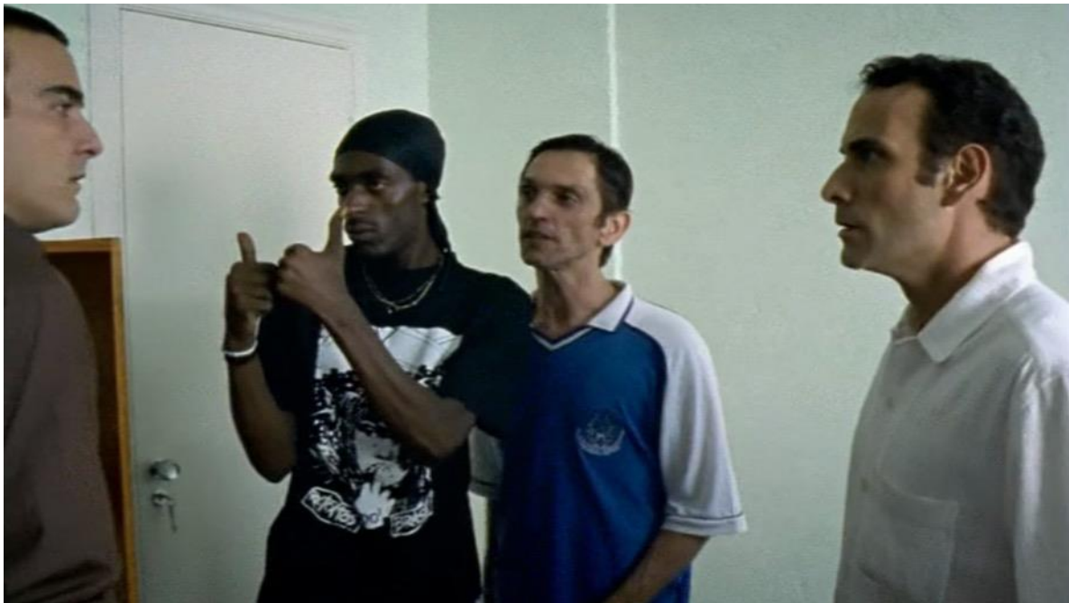
Figures 5 and 6: The “blocking and revealing” schema. O invasor . Drama Filmes. Screenshots.

When Sabotage starts rapping, his physical gestures shift from choreographed motions to a more spontaneous hip-hop performance. Although fictional, it seems disconnected from fiction and is imbued with the music’s rhythm. That is precisely Brant’s intention; for him, Sabotage’s personality and actions in the film oscillate from fiction to an actual music performance register. This is evident in the character’s exaggerated gestures and the slum slang he employs that add humour and authenticity to the scene, while Sabotage’s disregard for the basic rules of acting (with his furtive glances toward the camera) may spoil the filmmaker’s fictional intentions (Figures 7 and 8).