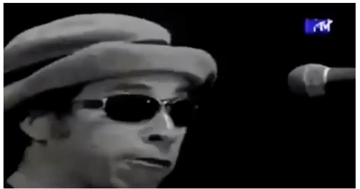
Figure 4: Chico Science in Sangue de bairro (Neighbourhood Blood , 1997), music video by Lírio Ferreira and Paulo Caldas. Saci Filmes, 1997. Screenshot.

Considering our historiographic method of approaching intermediality, studying songs also enables us to understand the films and contexts related to them. In this case, "Salustiano Song" is a tribute to Manoel Salustiano Soares (1945–2008), known as Mestre Salustiano (see Gaspar), a popular artist whose work includes ancestral rhythms, such as maracatu and cavalomarinho , among others. Mestre Salustiano became a kind of symbol for the Manguebeat and Árido Movie generation. In a documentary scene in the short Maracatu, maracatus , Mestre Salustiano makes an appearance and questions the role of marketing media in relation to popular art. He is talking about maracatu , but his criticism concerns a wider universe not only of music but also cinema. For this reason, Passages pays homage to him with the inclusion of the song "O enigma turco" ("The Turkish Puzzle", 2002) composed by Maciel Salú (Mestre Salustiano's son) and DJ Dolores. This song comes with a sonority that refers to both the maracatu ancestral culture and the Arab music linked to Benjamin Abrahão's life.