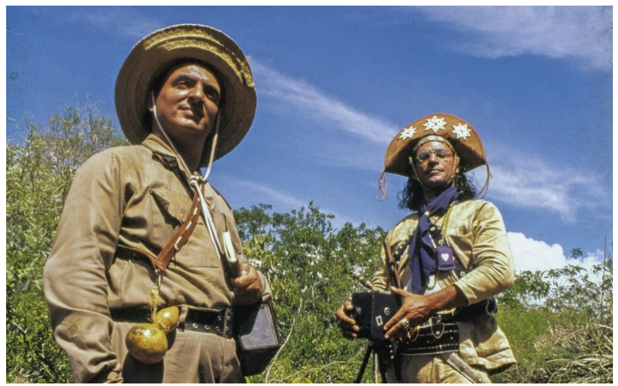
Figure 3: Benjamin Abrahão (Duda Mamberti) and Lampião (Luiz Carlos Vasconcelos) making film in Baile perfumado (Perfumed Ball, Paulo Caldas and Lírio Ferreira, 1996). Photograph by Fred Jordão. Saci Filmes, 1996.

plots. Amor, plástico e barulho (Love, Plastic and Noise , Renata Pinheiro, 2013) dramatises the audiovisual realisation of music videos.