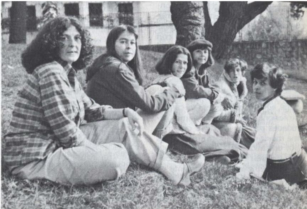
Figure 2: The women behind Cine Mujer.