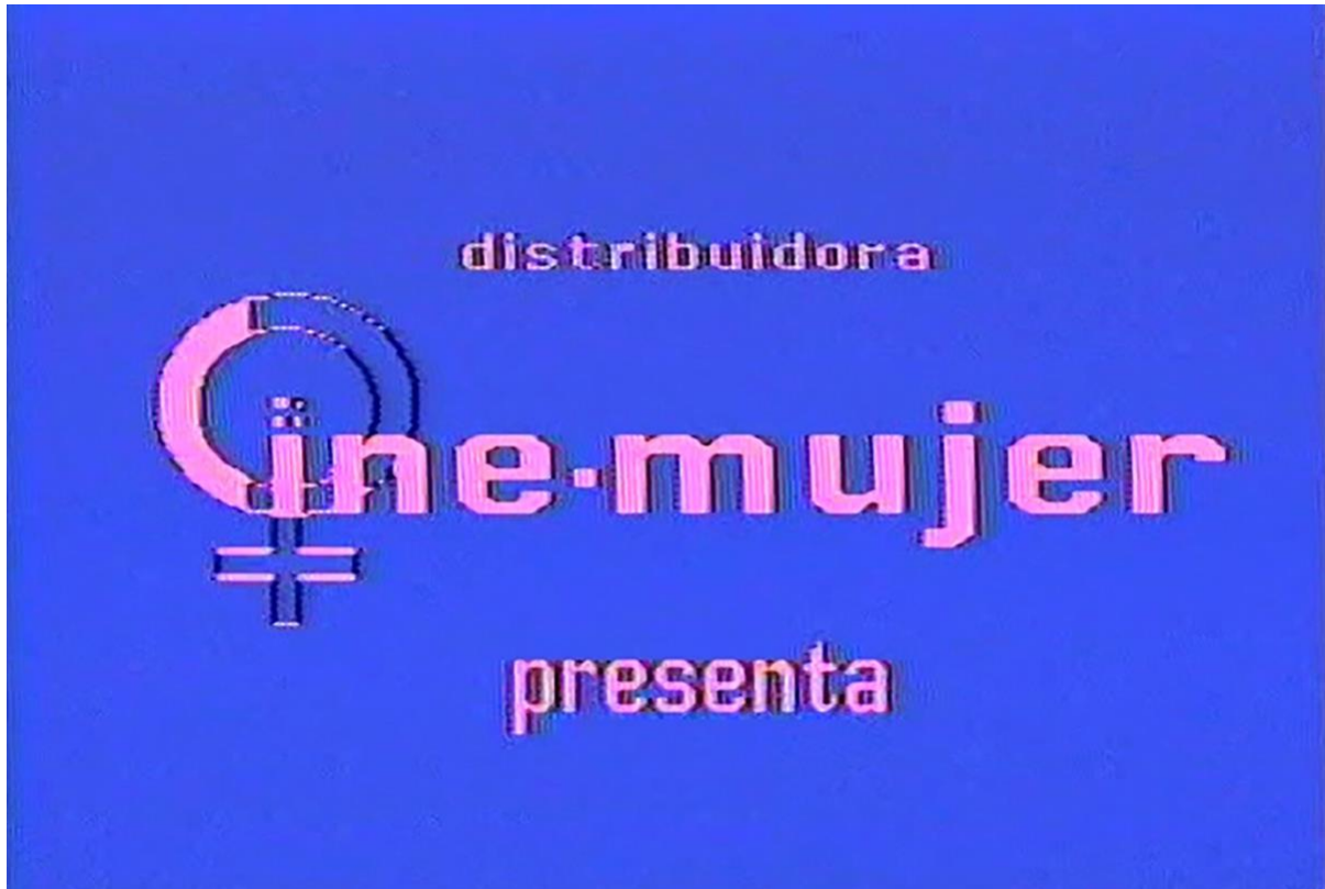
Figure 1: The logo of Cine Mujer. Screenshot.