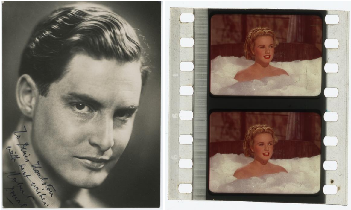
Figure 6 (left): Robert Donat Autograph from 1933 sent to Denis Houlston. Figure 7 (right): 35mm offcut: Deanna Durbin in Can't Help Singing (1944).

It has been of crucial importance to strike a balance between managing the collection for the physical and for the digital archive presented through the CMDA website, Lancaster University's library catalogue and Lancaster Digital Collections. From a traditional archival perspective, the need to fully survey, index and preserve the physical materials takes precedence, whereas now, within the digital humanities field and for CMDA, the digital aspect and the need for preservation and presentation of the digital materials are the overriding objectives. Although the archiving and display of the material within the Special Collections area needed some consideration, the presentation of the digital materials has been instrumental in informing the overarching approach and structure of the collection. Primarily, it more readily enables, and makes visible, the interconnectedness of the materials, and will also facilitate findings emerging from the QDA process to be fed into the functioning of the search engine. Records and display of the material nevertheless have needed to be adjusted to the specifications of the individual platforms and differentiating between the varying requirements has proved challenging at times. Transparency and consistency, both in view of the system and in detailed documentation of the progress, have therefore been essential in maintaining an overview over the development of the archive.