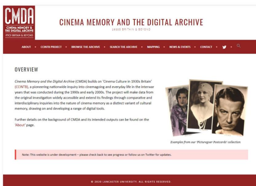
Figure 4: Screenshot of the CMDA project website.

Resulting from useful comments received in our first Steering Committee meeting, discussions also ensued on the merits of having two entry points to the site, or two routes through it, one for professional researchers and one for the wider public. 8 This idea was eventually thrown out as likely to prove unwieldy in practice, in favour of an emphasis on the use of clear pointers to content and functionality throughout the site, with the aim of making it intelligible and accessible to all. This key focus on usability also specified the need for both simple and advanced search mechanisms for querying the project database, which will act as repository for all digitised material from the collection. Once core functionality and a skeleton navigation system for the site had been agreed, attention turned to its visual appeal, often referred to by web designers as the “look and feel”. Here, an emphasis has been placed on creating a simple yet flexible design for the user interface that facilitates both the easy incorporation of new areas, and the showcasing of key items from the collection as digitised versions become available.