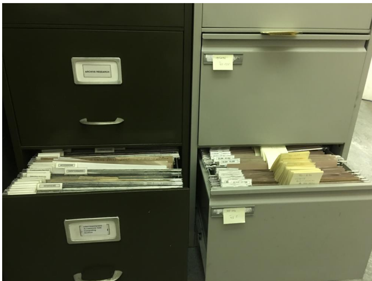
Figure 1: The original CCINTB project's filing cabinets.

Although the research resulting from CCINTB has populated and inspired the field of historical cinema audience research and memory studies, 4 the material itself has remained largely inaccessible to scholars, hidden away in storage boxes and cabinets in the depths of Lancaster University Library's Special Collections.